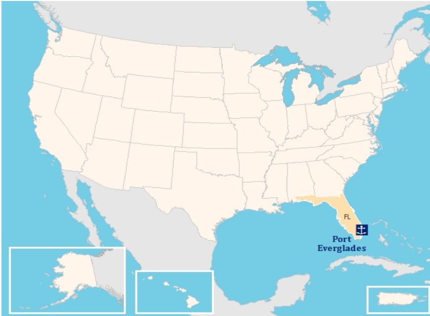
Ship anchor icon depicts port location